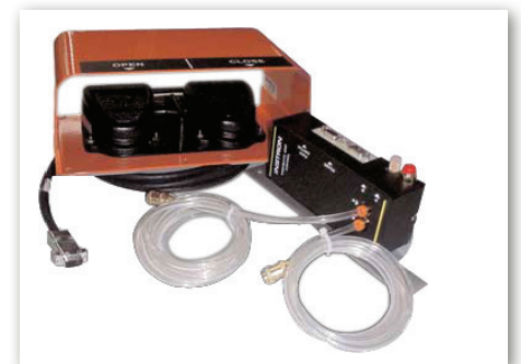
Automatic air control kit for pre-tension control