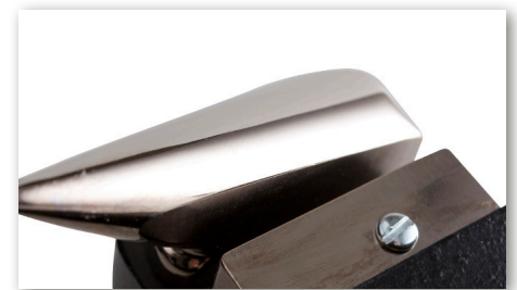
Close-up of horn and clamping face