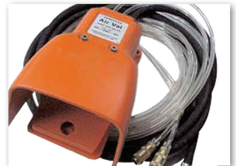
Pneumatic foot switch